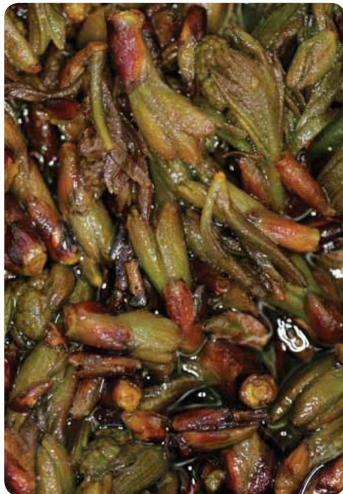
Gemmos being macerated

The alcohol extracts all active principles such as alkaloids, heterocycles, and glycosides. The glycerin extracts all of the essential oils, phenols, and flavonoids. This ensures that the entire profile of all active biochemical ingredients is extracted and concentrated; not only those that are alcohol-soluble as is found in most herbal tinctures.